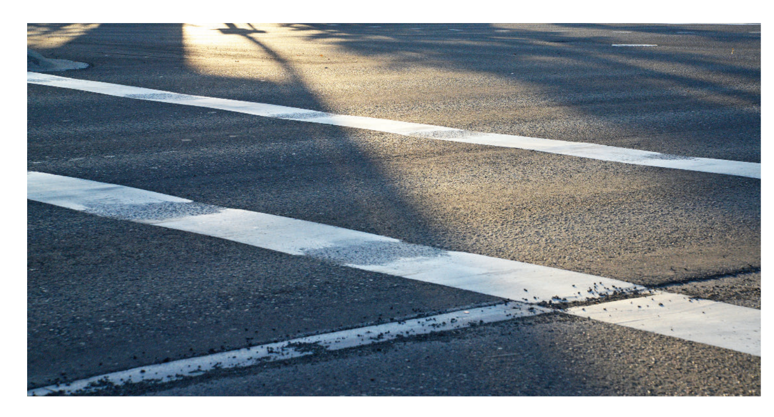
Undulating transverse shadows across rutted pavement -- and gouged intersectionstriping -- shows rut damage caused by studded tires on Minnesota Avenue in Anchorage

Rutting caused by studded tire wear is a serious problem in the American Pacific Northwest, costing the states of Oregon, Washington and Alaska millions of dollars annually in damage to both asphalt and Portland cement concrete roads.