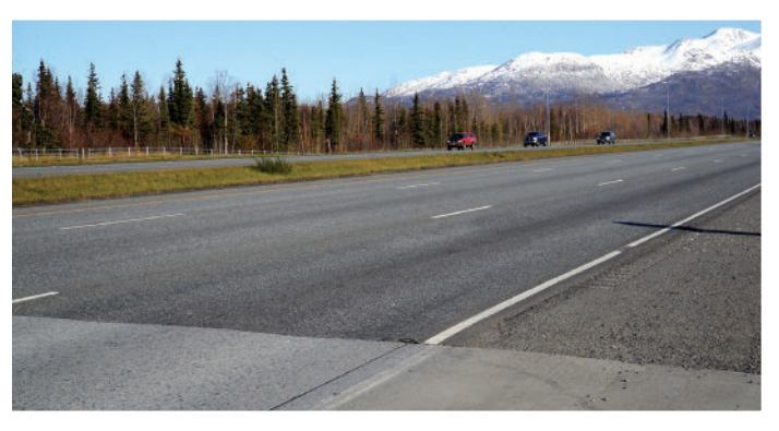
\operatorname{HiMA} mix, eastbound Glenn Highway Alaska S.R. 1 at weigh station near Eagle River shows minimal studded tire rutting after two years

So following the successful performance of the 5th and 6th Avenues in Anchorage, Alaska DOT&PF specified the same PG 64E-40 HiMA binder grade for resurfacing of the Glenn Highway.