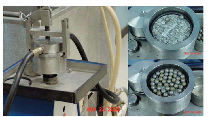
Alaska DOT&PF's Prall tester for studded tire damage

To fight studded tire rutting in asphalt pavements, the Alaska DOT&PF has turned to using highly modified asphalt (HiMA) in their wearing course mixtures, which is produced using Kraton™ D0243, an SBS modifier manufactured by Houston-based Kraton Polymers.