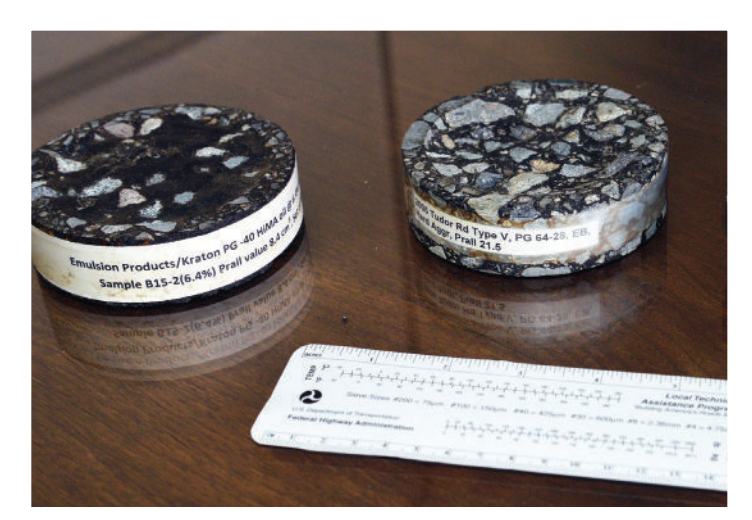
The standard Prall test specimen on the right shows typical abrasion with most of the aggregate clearly visible. The Prall test steel spheres progressively wear the binder and fine aggregate from the specimen surface. With the PG-40 HiMA binder specimen at left, much less of the surface is abraded due to its resilience, thus it can continue to protect the aggregate below from fracture

Lab tests confirm these performance properties, Kluttz says. The Prall test, Alaska Test Method 420, for studded tire damage was originally developed in the Nordic countries and is standardized as EN12697-16 in the European Committee for Standardization (hence the standard SI units). Test specimens are 100. mm (3.9 in.) in diameter and 30. mm (1.2 in.) thick and are tested at 5 °C (41 °F). The specimen is loaded in the test device and covered with 40 stainless steel spheres 12 mm (0.47 in.) in diameter. The test chamber is oscillated with a stroke of 43 mm (1.7 in.) at a frequency of 950 strikes per minute for a period of 15 minutes.