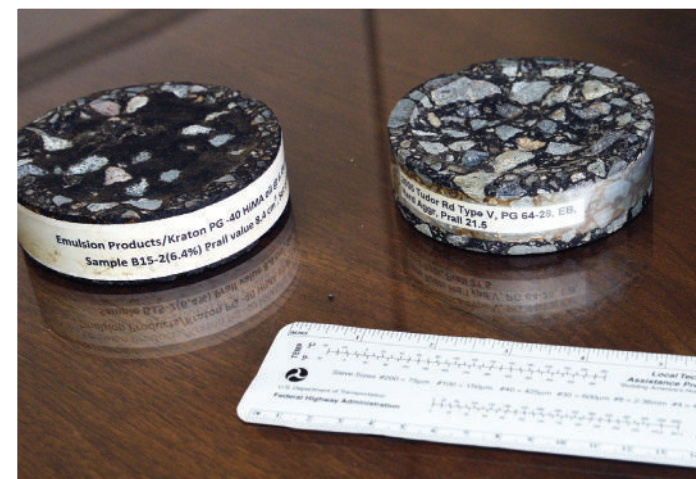
The standard Prall test specimen on the right shows typical abrasion with most of the aggregate clearly visible. The Prall test steel spheres progressively wear the binder and fine aggregate from the specimen surface. With the PG-40 HiMA binder specimen at left, much less of the surface is abraded due to its resilience, thus it can continue to protect the aggregate below from fracture

Lab tests confirm these performance properties, Kluttz says. The Prall test, Alaska Test Method 420, for studded tire damage was originally developed in the Nordic countries and is standardized as EN12697-16 in the European Committee for Standardization (hence the standard SI units). Test specimens are 100. mm (3.9 in.) in diameter and 30. mm (1.2 in.) thick and are tested at 5 °C (41 °F). The specimen is loaded in the test device and covered with 40 stainless steel spheres 12 mm (0.47 in.) in diameter. The test chamber is oscillated with a stroke of 43 mm (1.7 in.) at a frequency of 950 strikes per minute for a period of 15 minutes.