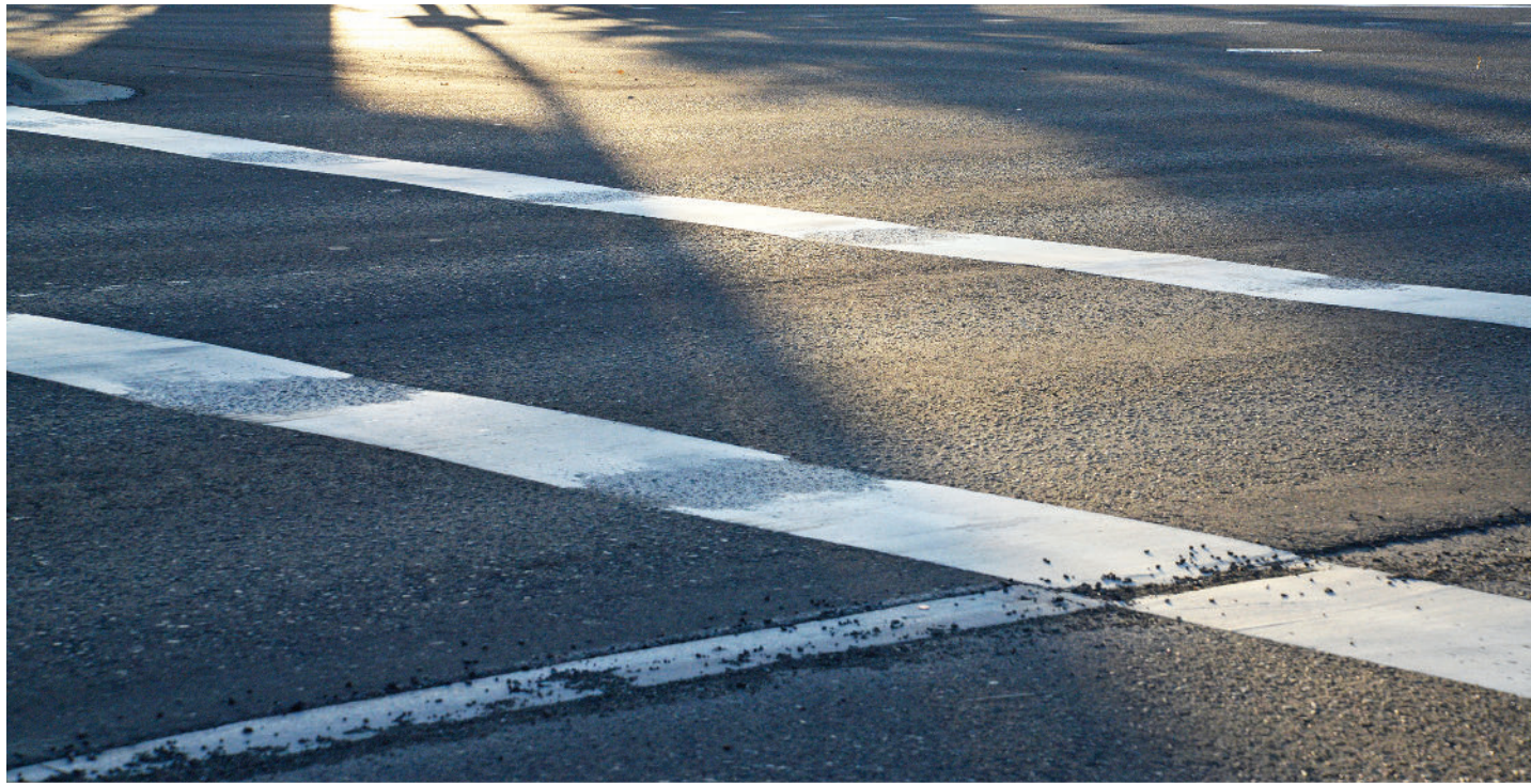
Undulating transverse shadows across rutted pavement -- and gouged intersection striping -- shows rut damage caused by studded tires on Minnesota Avenue in Anchorage

Rutting caused by studded tire wear is a serious problem in the American Pacific Northwest, costing the states of Oregon, Washington and Alaska millions of dollars annually in damage to both asphalt and Portland cement concrete roads.