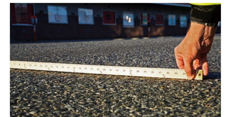
After four winter seasons (2015-2019), 200 block of E 5th Avenue with HiMA-modified PG 64-40 E binder shows minimal rutting

The wheel paths look dark much like the Prall test specimens, indicating that roughly the same behavior is occurring in the laboratory and in the field. The Alaska DOT&PF is pleased with the performance and is specifying more projects with modified PG 64-40 E binder and hard aggregates, designated as Hot Mix Asphalt, Type VH by Alaska DOT&PF.