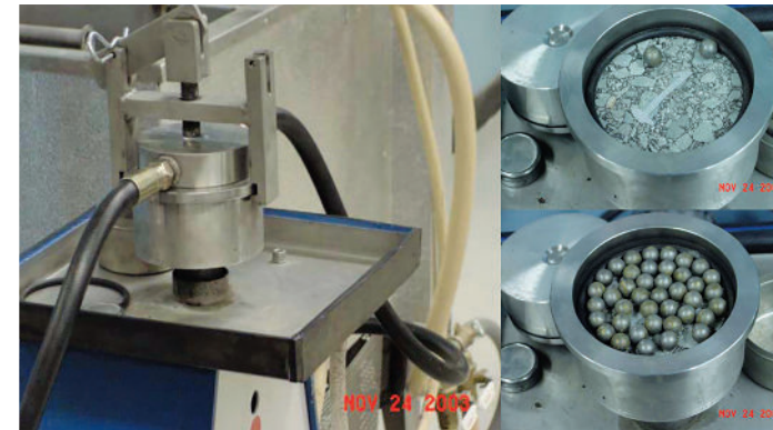
Alaska DOT&PF's Prall tester for studded tire damage

To fight studded tire rutting in asphalt pavements, the Alaska DOT&PF has turned to using highly modified asphalt (HiMA) in their wearing course mixtures, which is produced using Kraton™ D0243, an SBS modifier manufactured by Houston-based Kraton Polymers.