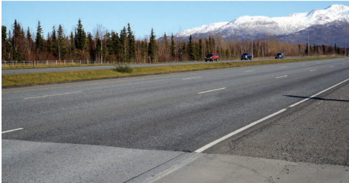
HiMA mix, eastbound Glenn Highway Alaska S.R. 1 at weigh station near Eagle River shows minimal studded tire rutting after two years

So following the successful performance of the 5th and 6th Avenues in Anchorage, Alaska DOT&PF specified the same PG 64E-40 HiMA binder grade for resurfacing of the Glenn Highway.