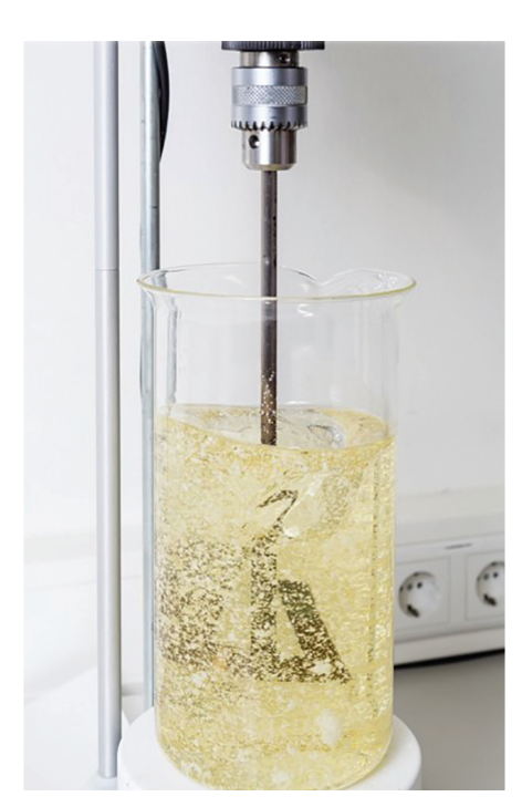
Mixing under high or low shear