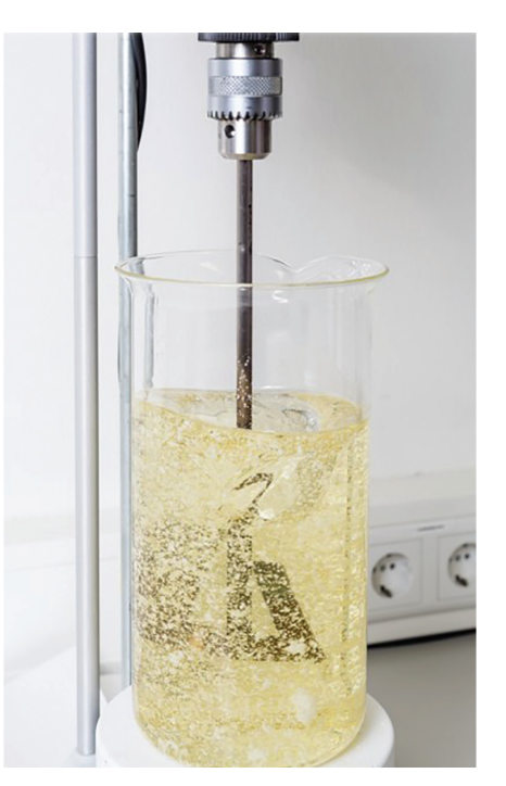
Mixing under high or low shear