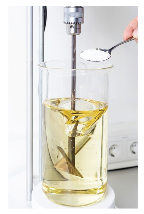
Addition of Ellamera polymer to warm oil

*These are typical values and should not be used to set specifications. **Depends on the oil composition