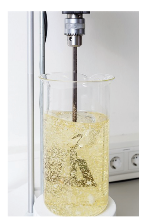
Mixing under high or low shear