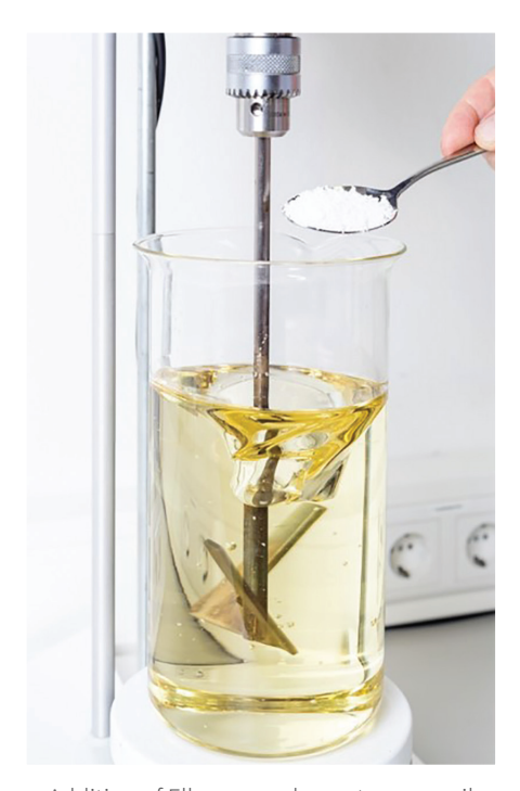
Addition of Ellamera polymer to warm oil