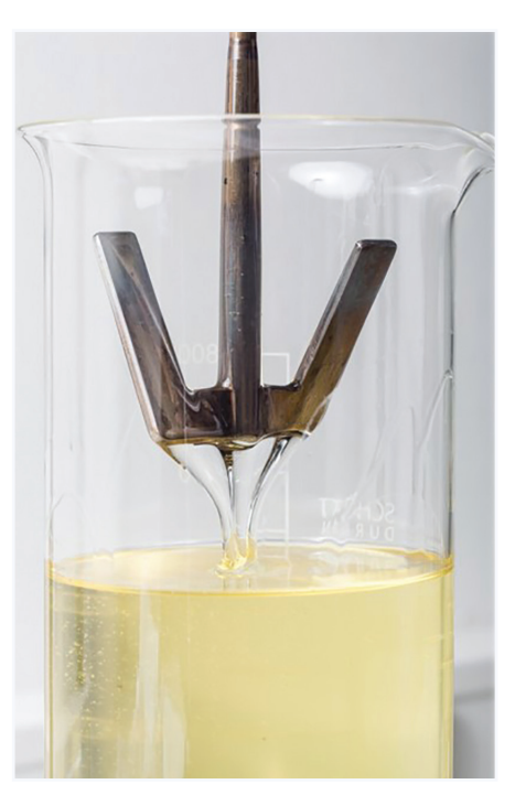
Gel formation upon cooling down